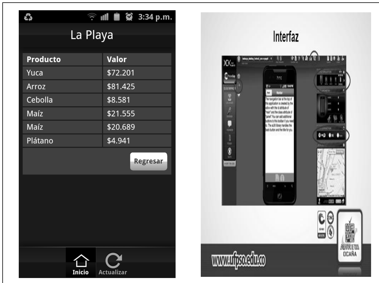
Fig. 2. Information of products based on prices

At this moment the tests have been stopped in order to detect the inconsistencies of the mobile phone connection; however, this is the first phase to be analyzed in this responsibility, acceptance and necessity of the farmer for the implantation of this application whose results show the necessity in this area of agriculture. Later on, in phase II the data will be gotten with those statistics of the use of the platform and the obtained information about the cellular phone.